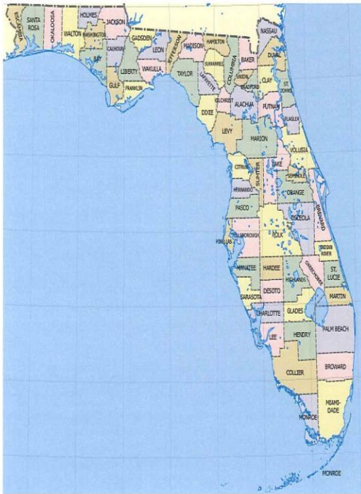
Florida State Map 67 Counties